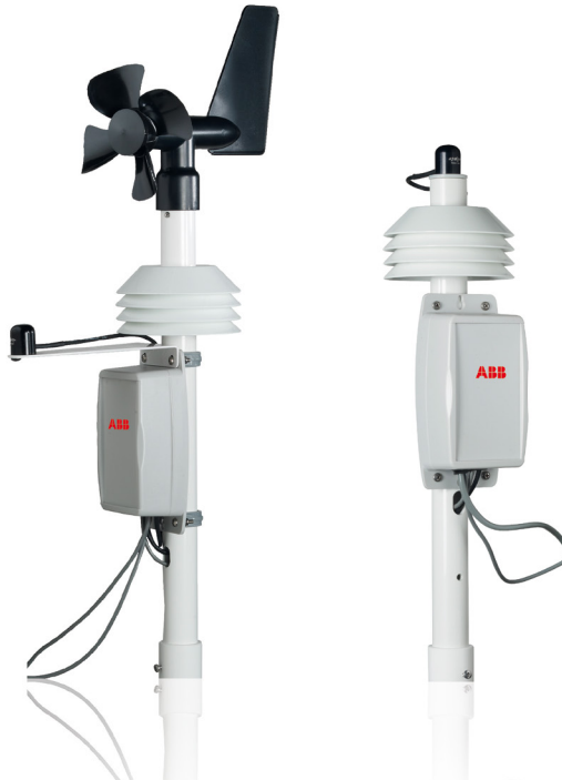
ABB monitoring and communications VSN800 Weather Station

The VSN800 Weather Station automatically monitors site meteorological conditions and photovoltaic panel temperature in real-time, transmitting sensor measurements to the Aurora Vision® Plant Management Platform.